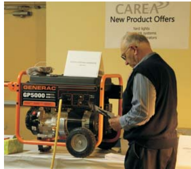
New products offered by CAREA on display for members consideration.