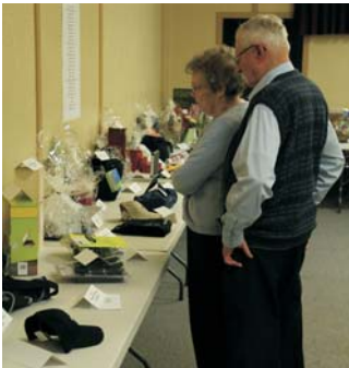
Door prizes on display in Innisfail.